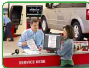
7. Sell the alignment (when needed)

HUNTER Engineering Company www.hunter.com