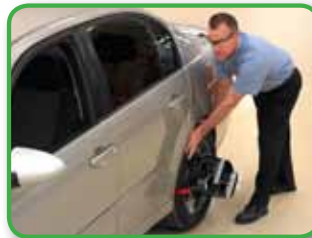
3. Roll vehicle forward