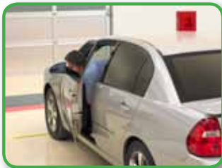
1. Pull car in and stop