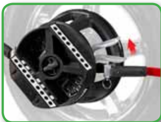
5. Remove QuickGrip adaptors