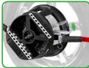
2. Mount QuickGrip adaptors