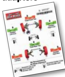
6. Get printout